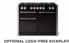
OPTIONAL LOGO-FREE KICKPLATE