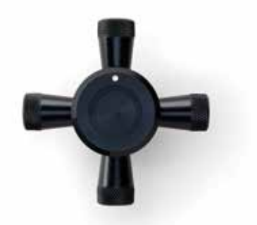
BLACK ANODIZED ALUMINUM