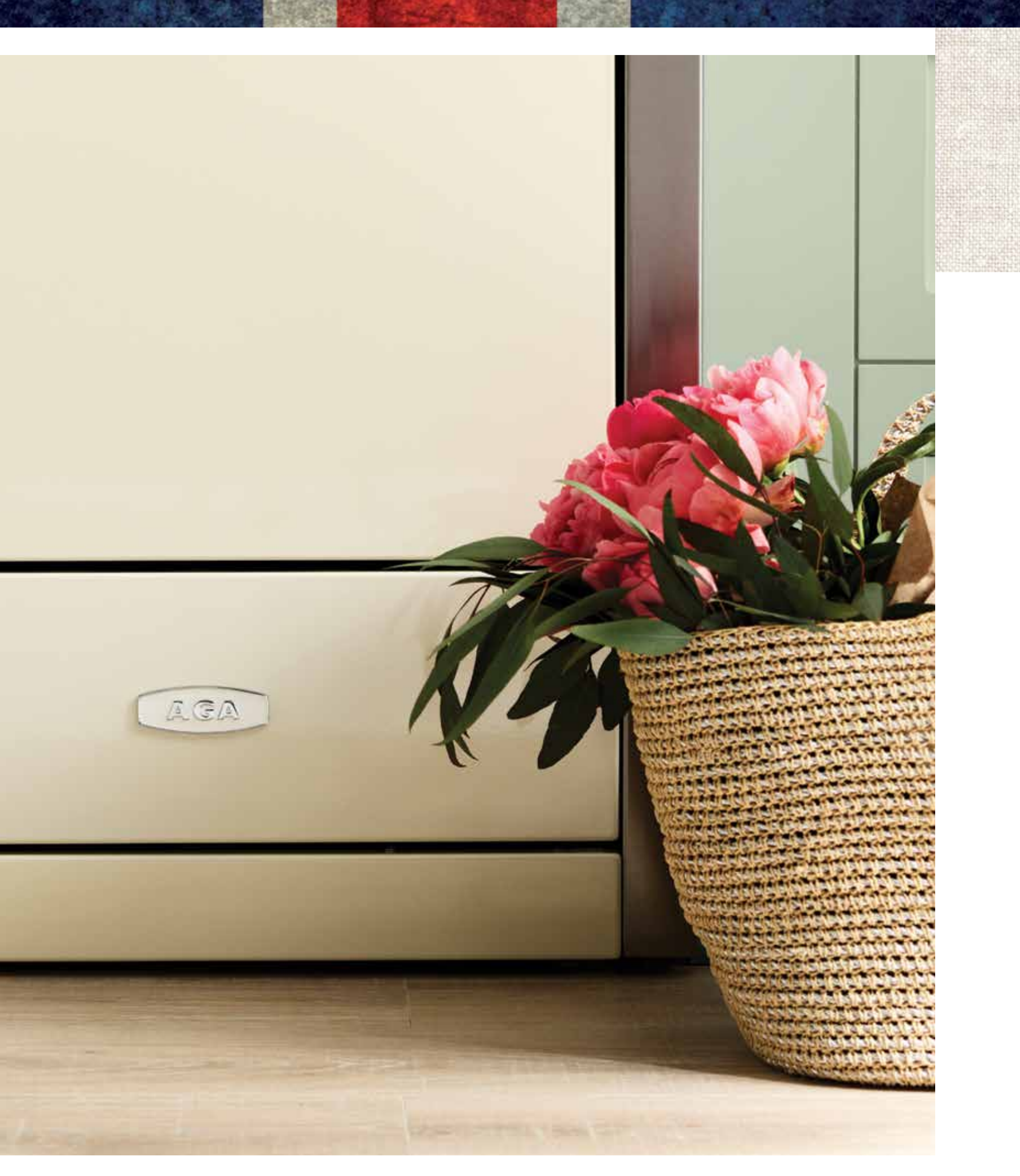
For a full production overview on all Elise products, please visit www.AGArangeusa.com