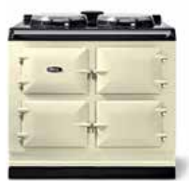
1 1 N I E N I