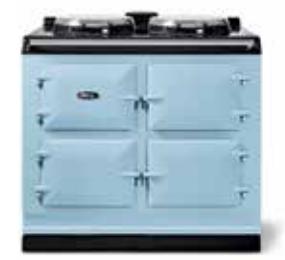
DUCK EGG BLUE